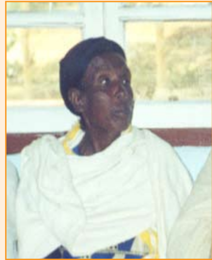
W/o Bizu, grandmother of the two young orphan girls.